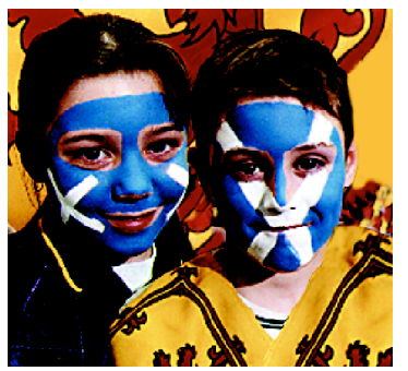
Young Scottish supporters painted up with the national flag before an international match.

sisting of a St George's Cross with a relatively insignificant Union Flag in the canton). After the Act of Union, the use of the St Andrew's Cross declined. A yellow or gold saltire on a blue field was used, however, during the Jacobite risings of 1715 and 1745.