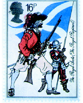
The Saltire is the regimental flag of the Royal Scots, the oldest infantry regiment of the line whose origins go back to 1633.